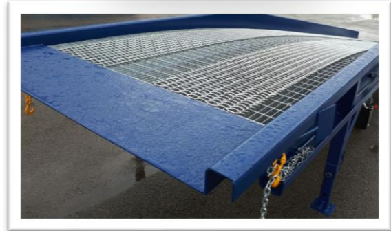
Curved driving profile

In addition to our standard products we also design and manufacture loading solutions based on customers requests.